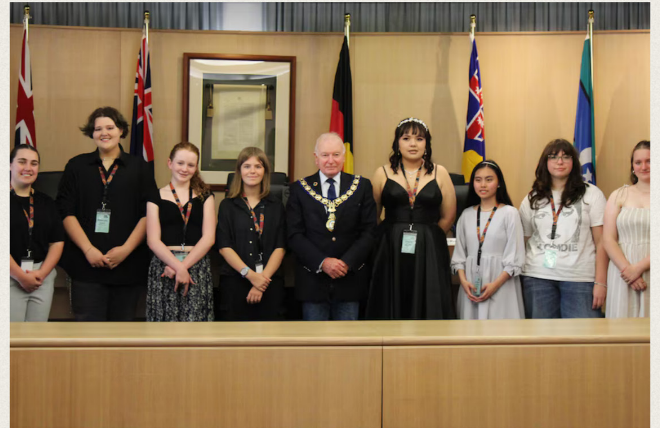
Youth Forum at their swearing-in ceremony with Lord Mayor Gordon Bradbery

The Youth Forum has set their priorities for the rest of their term in office and will continue to deliver projects and advocate on these issues. The priorities for the 2023 - 2024 Youth Forum are: